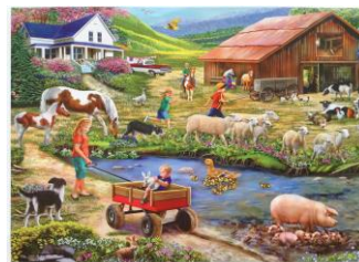
Bits and Pieces 300 piece River Escapades (Watering Hole)

(Virtual Jigsaw Puzzle Contest--individual)