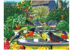
Cobble Hill 500 piece Bird Bath

Sponsored by: SpeedPuzzling.com https://www.facebook.com/groups/SpeedPuzzling/